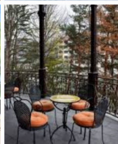
AUTUMN IN THE AST WORLD

Our diversity and world view is one of the most spectacular things about AST. Together we gather with sand to heal and serve our amazing clients.